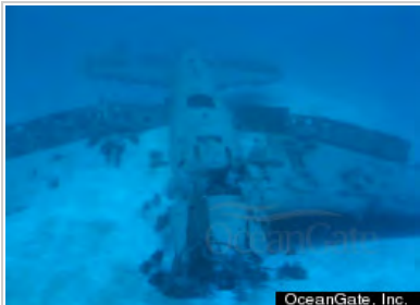
Researchers discovered the WWII-era Hellcat fighter plane wreckage off the coast of Miami while examining artificial reefs.

The Huffington Post | By Ryan Grenoble Posted: 11/28/2012 12:43 pm EST