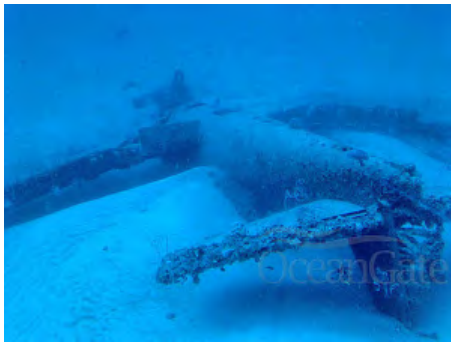
An upside down U.S. Navy Hellcat fighter plane discovered by the crew of the submarine Antipodes in deep water off Miami Beach.

MIAMI BEACH (CBSMiami) – Researchers studying artificial reefs off Miami-Dade County made an amazing discovery off Miami Beach, a mostly intact wreck of a U.S. Navy World War II fighter plane lying upside down 240 feet deep off Miami Beach, according to CBS4 News partner The Miami Herald .